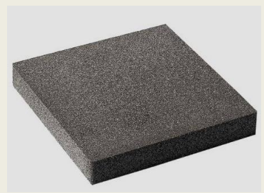
Fig 2: FOAMGLAS® product