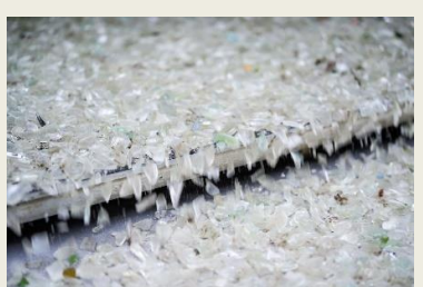
Fig 1: Raw material